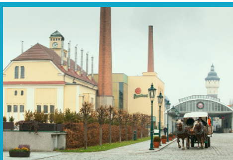
Brewery in the Pilsen

Beer is the world's most consumed alcoholic drink and in the Czech Republic we brew the best beer in the world. It's considered to be our national icon. The most famous beer from our state is "Pilsner Urquell" from Pilsen, but we have other great producers. For example "Budweiser" from Budweis and "Starobrnó" from Brno.