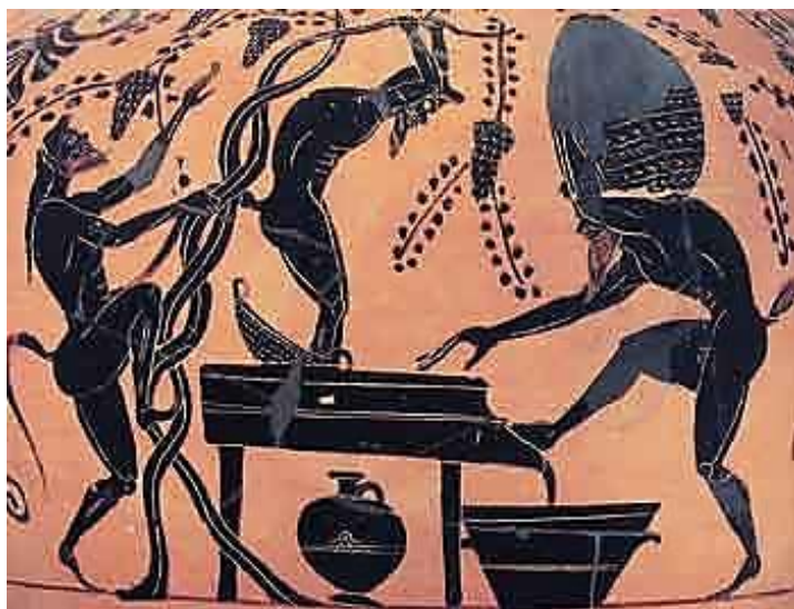
Τρύγος και πάτημα σταφυλιών στην αρχαιότητα. Παράσταση σε αγγείο.